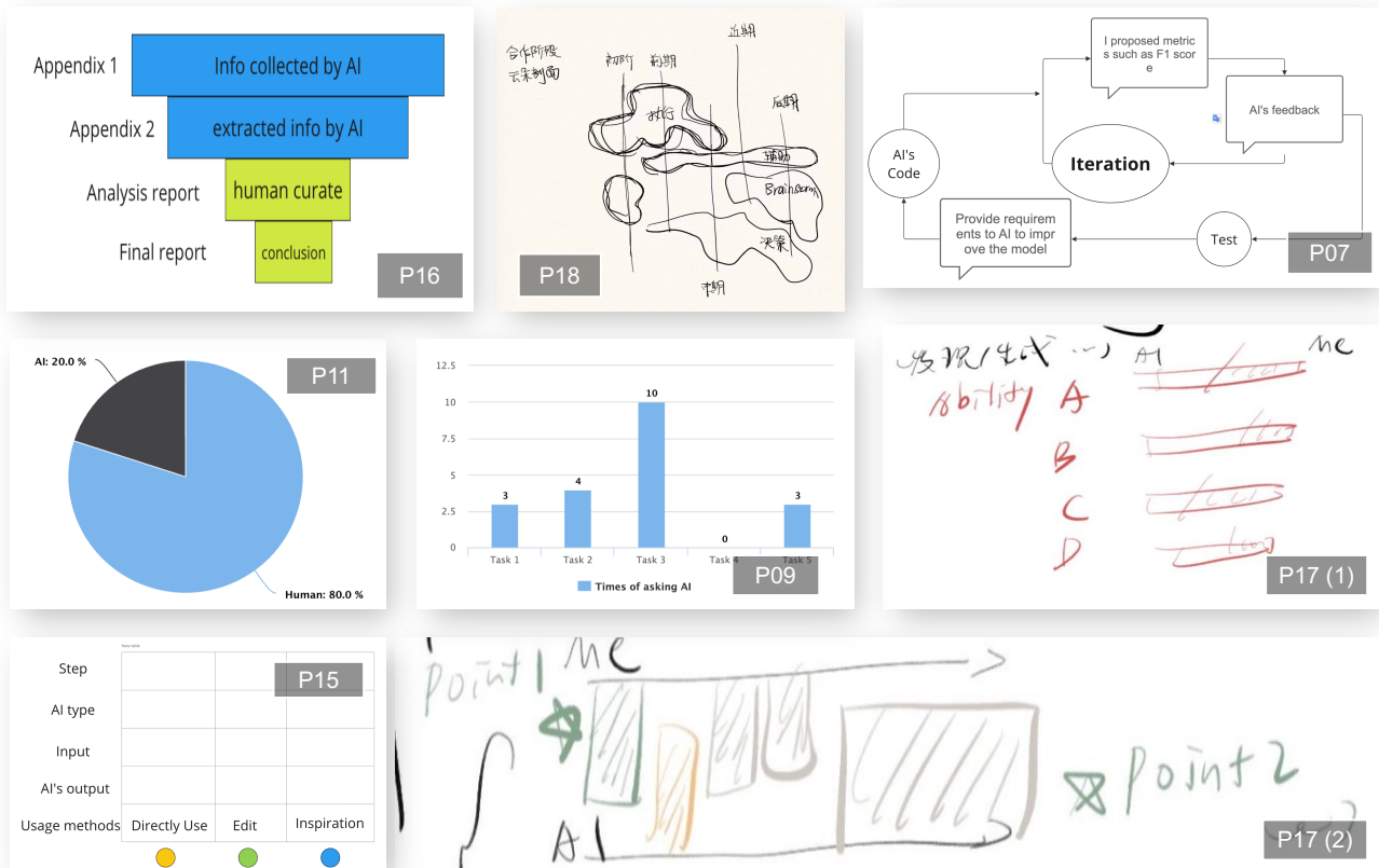
Figure 3: A subset of designs of the reporting of students' AI usage resulted from step 2 of activity 3 of the co-design workshop. We explain the designs when we mention them in the main text.

insights, which we refer to as framing idea . Nevertheless, not every usage analysis has corresponding data framing, possibly limited by participants' data and visualization literacy, but it is worth future research.